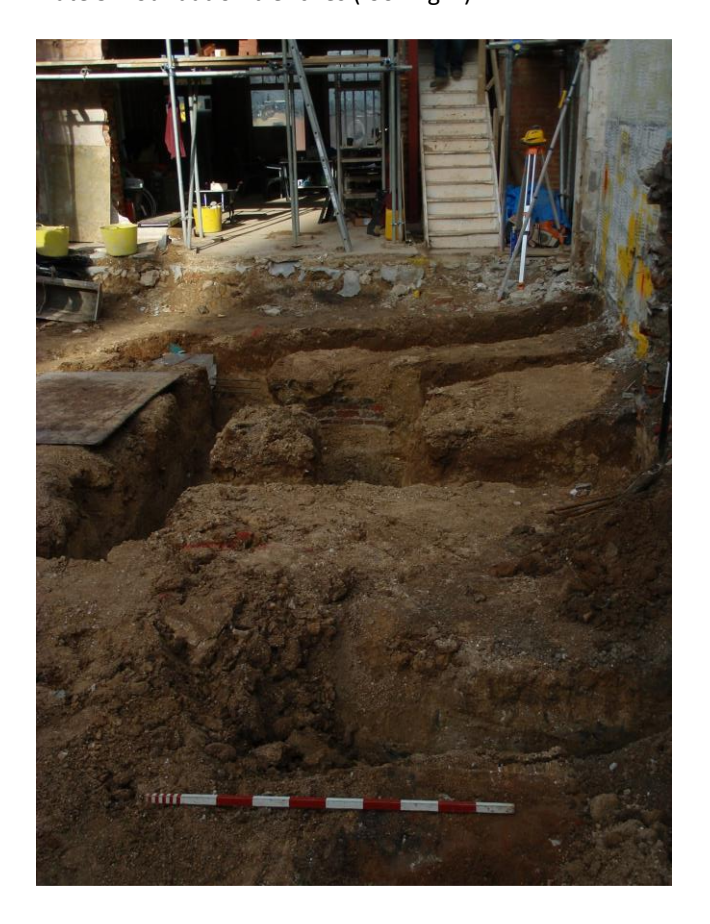
Plate 6. Foundation trenches completed (looking NE)