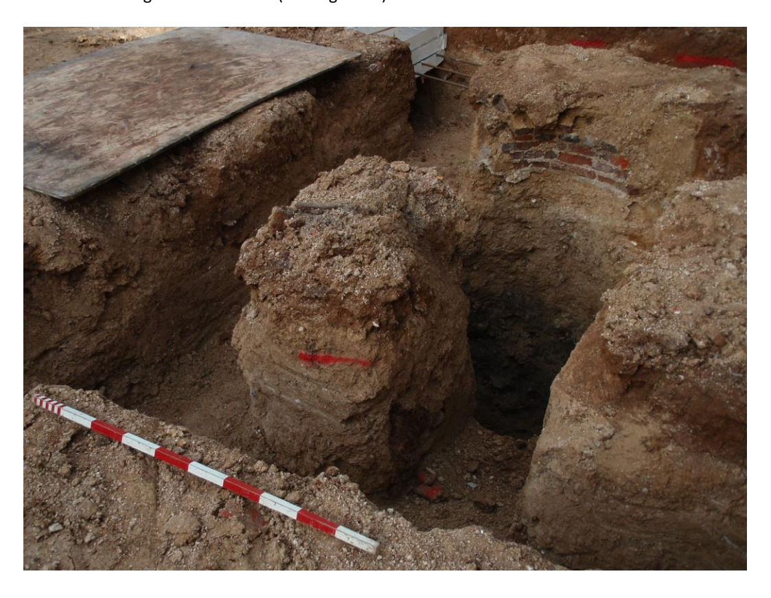
Plate 4. View of foundation trenches (looking NNE)