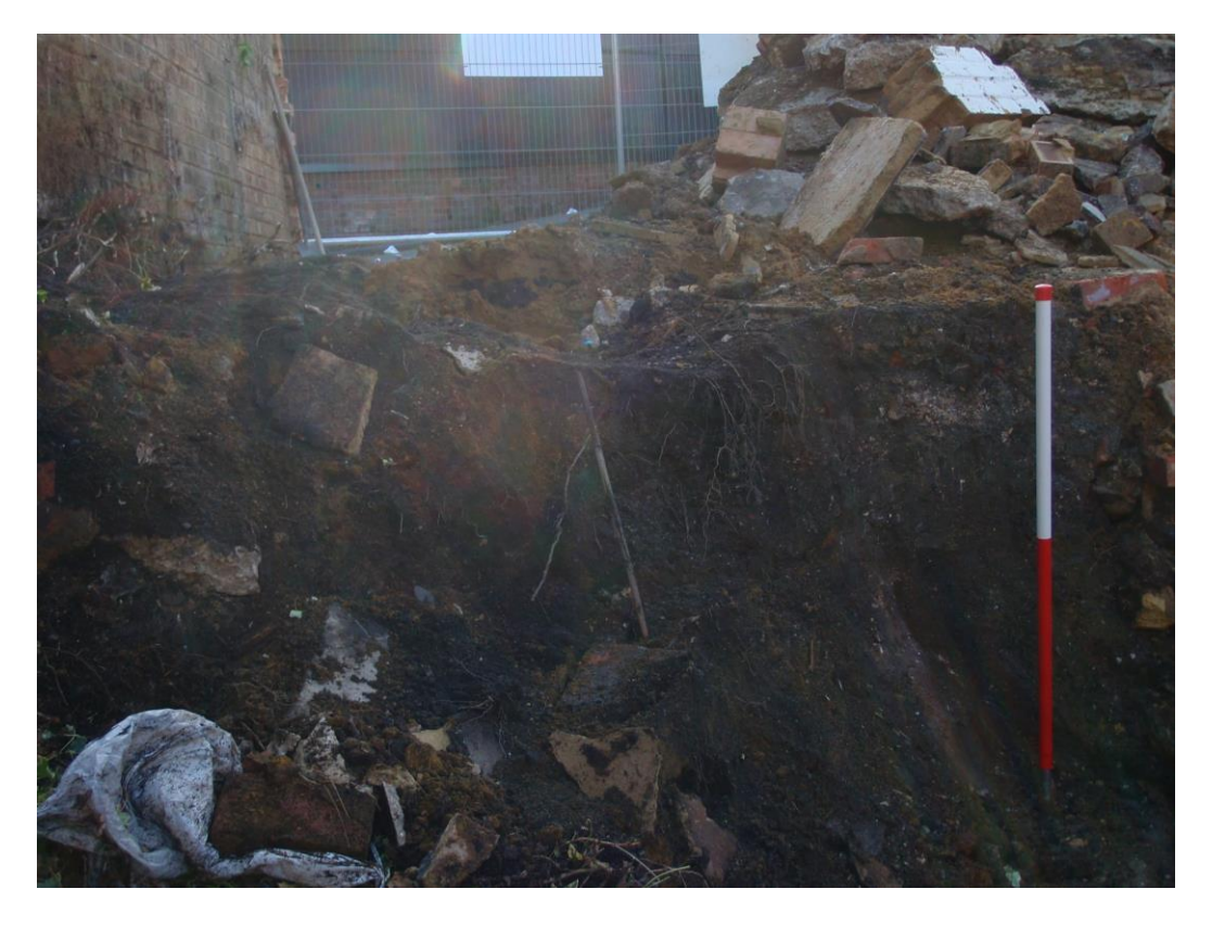
Plate 2. View of demolition in progress (looking N)