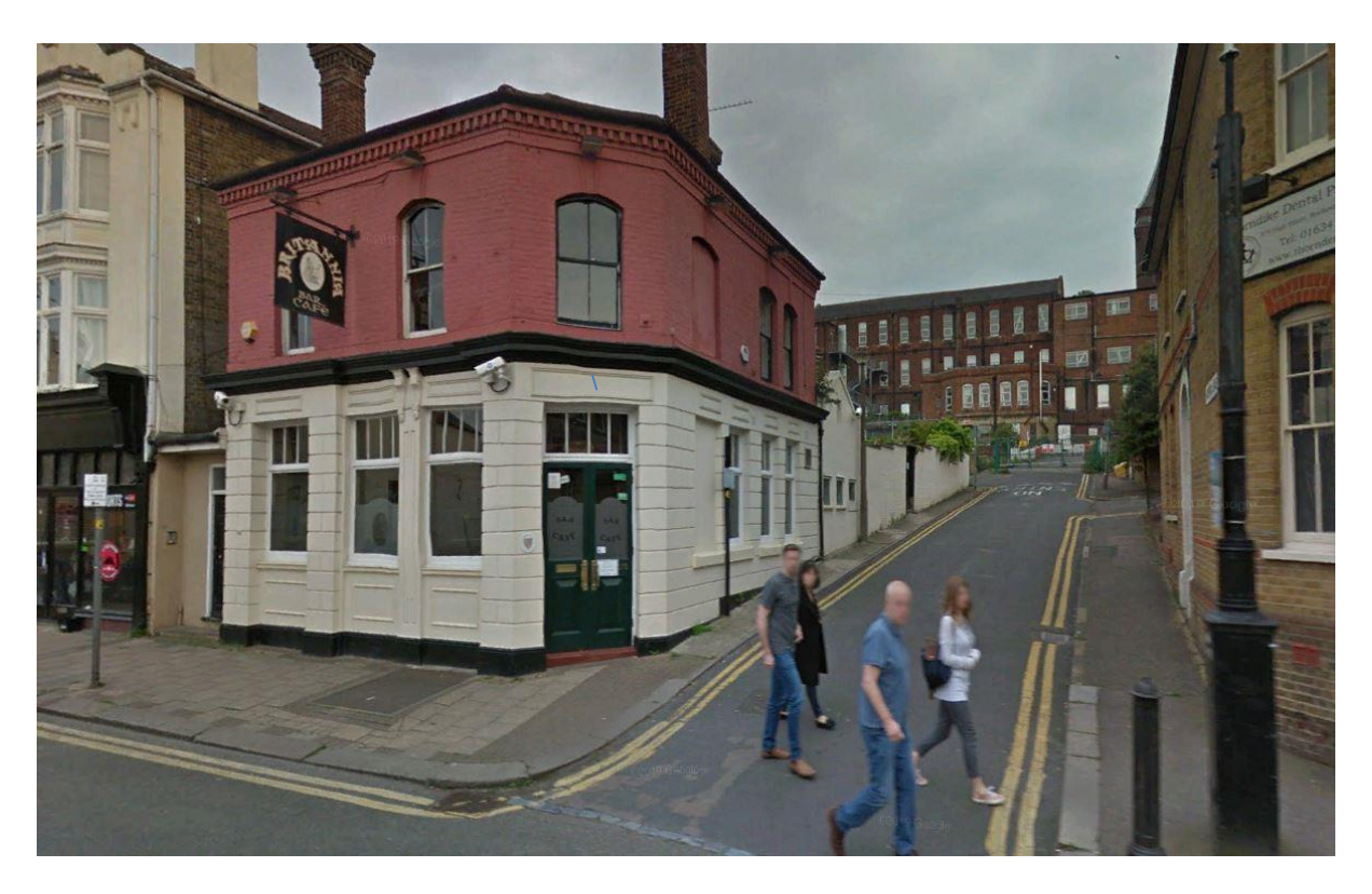
AP 1. View of proposed development site (Google 2018)