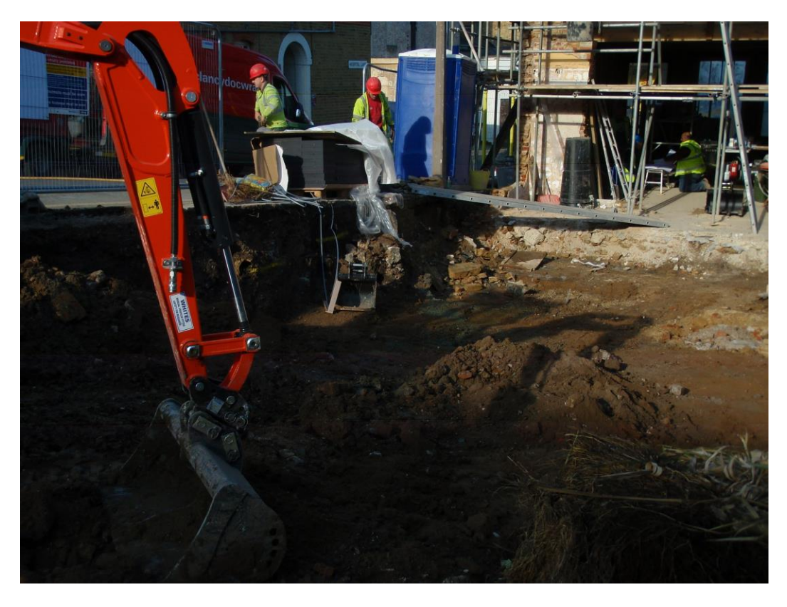
Plate 3. View of ground reduction (looking NNW)