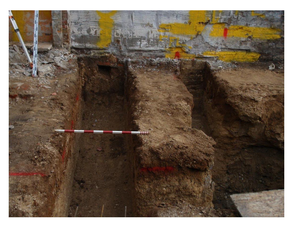
Plate 5. Foundation trenches (looking N)